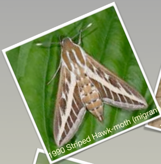
1990 Striped Hawk-moth (migrant)