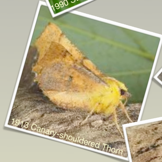
1913 Canary-shouldered Thorn