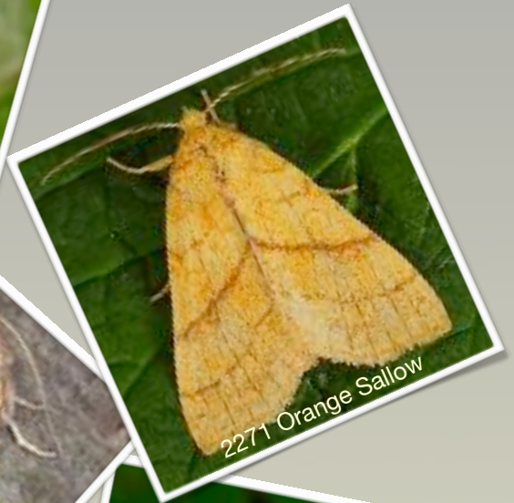
2271 Orange Sallow