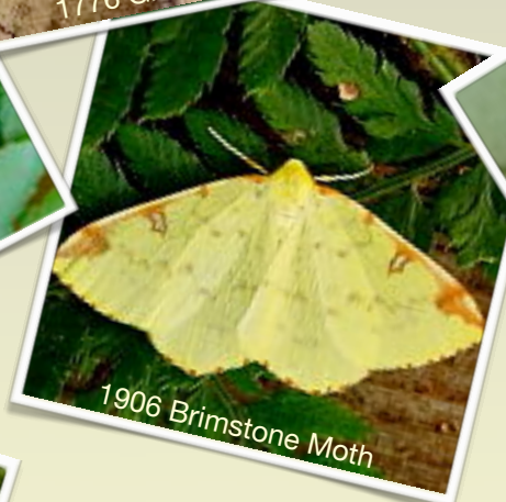
1906 Brimstone Moth