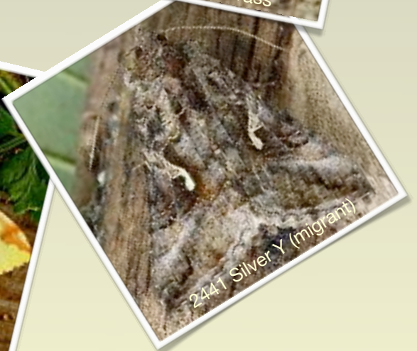
2441 Silver Y (migrant)