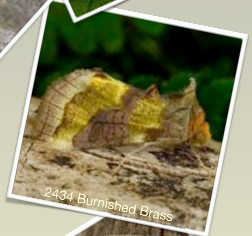
2434 Burnished Brass