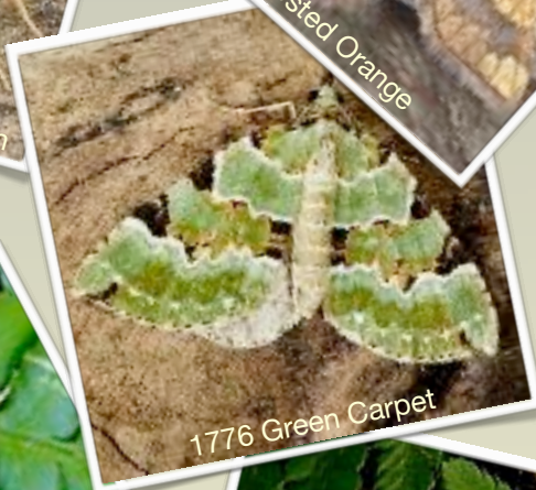
1776 Green Carpet