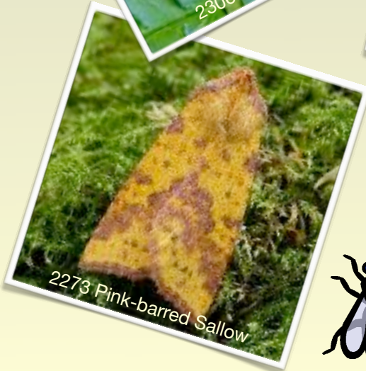
2273 Pink-barred Sallow

We're taking part in the National Moth Night as part of WASP, our Wild About Science Project. We're running a moth-trap overnight, recording the species we catch and sending in our results. The organisers are particularly interested in recording migrant species so let's hope we get some warm southerly winds!