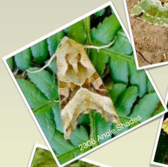
2306 Angle Shades